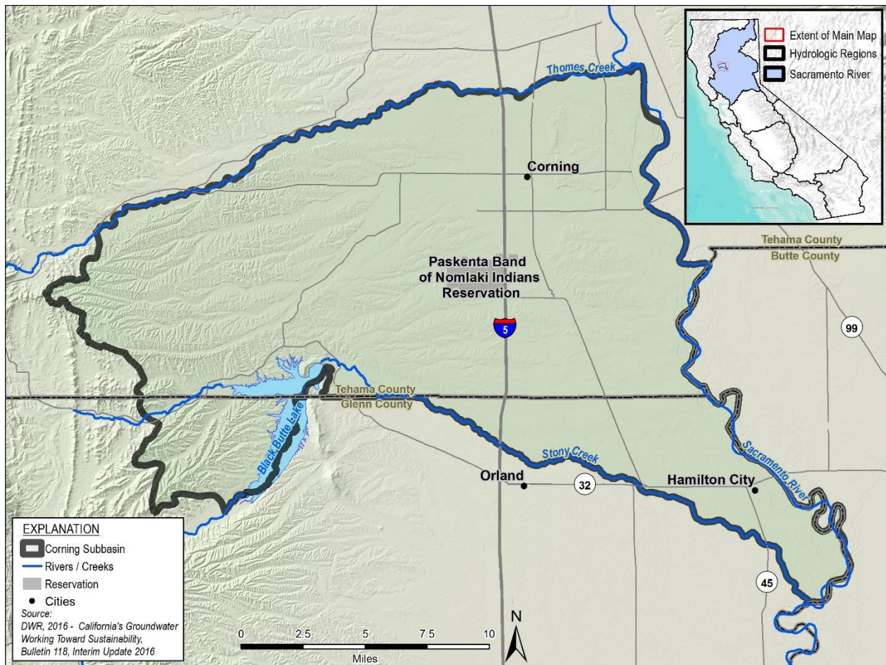
Figure 1-1. Corning Subbasin Location

This Groundwater Sustainability Plan (GSP or “Plan”) was prepared for the Corning Subbasin (Subbasin) (Figure 1-1) to fulfill the requirements of the 2014 California Sustainable Groundwater Management Act (SGMA). This section of the Plan presents the purpose of the GSP, the Subbasin sustainability goal, and pertinent information about the local Groundwater Sustainability Agencies (GSAs or Agencies) formed to develop and implement the Plan.